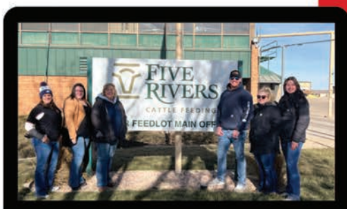
Top of Class 2023