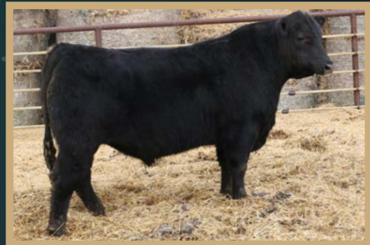
AAA #: 20863295 // ACT. BW: 82 // ADJ. WW: 767 Tehama Tahoe B767 X Ellingson Dominance 2079 CED BW WW YW SC HP MARB RE $M $C 7 -0.4 69 124 2.01 13.2 0.45 0.80 60 227