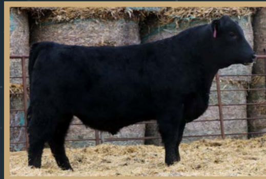
AAA #: 20785271 // ACT. BW: 86 // ADJ. WW: 811 Wilks Regiment 9035 X Bar S Sure Deal 5202 CED BW WW YW SC HP MARB RE $M $C 6 0.9 68 126 0.15 11.8 0.47 0.60 60 223