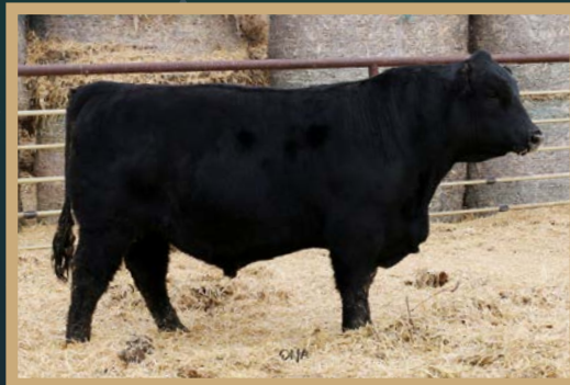
AAA #: 20664035 // ACT. BW: 100 // ADJ. WW: 727 Deer Valley Wall Street X CLWTR Beacon Ally D72 CED BW WW YW SC HP MARB RE $M $C -5 4.5 72 131 1.87 13.8 0.32 0.43 57 228