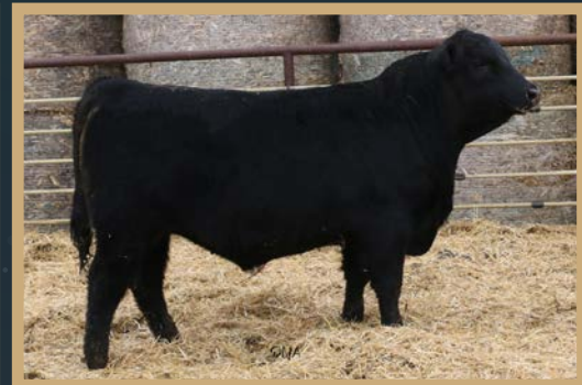
AAA #: 20760153 // ACT. BW: 79 // ADJ. WW: 742 DB Iconic G95 X G A R Ingenuity CED BW WW YW SC HP MARB RE $M $C 6 2.2 77 133 0.67 10.9 1.25 0.26 85 278