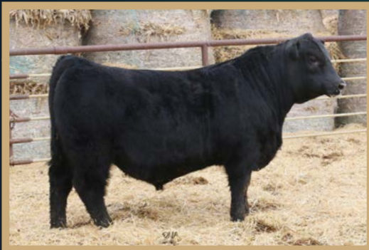
AAA #: 20780934 // ACT. BW: 72 // ADJ. WW: 789 Wilks Regiment 9035 X Bar S Sure Deal 5202 CED BW WW YW SC HP MARB RE $M $C 9 0.9 84 147 0.66 13.8 0.43 0.97 61 257