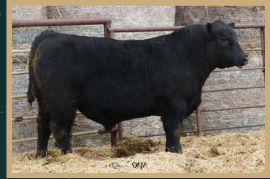
AAA #: 20663945 // ACT. BW: 89 // ADJ. WW: 698 Woodhill Blueprint X Connealy Commonwealth CED BW WW YW SC HP MARB RE $M $C 6 1.5 73 121 0.26 13.3 0.66 0.68 74 261