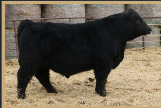
AAA #: 20790107 // ACT. BW: 87 // ADJ. WW: 712 Wilks Regiment 9035 X Bar S Sure Deal 5202 CED BW WW YW SC HP MARB RE $M $C 3 2.3 86 157 0.87 11.1 0.16 0.75 60 268