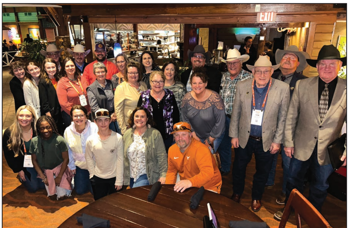
Minnesotans gather in Orlando at NCBA's 2024 CattleCon.