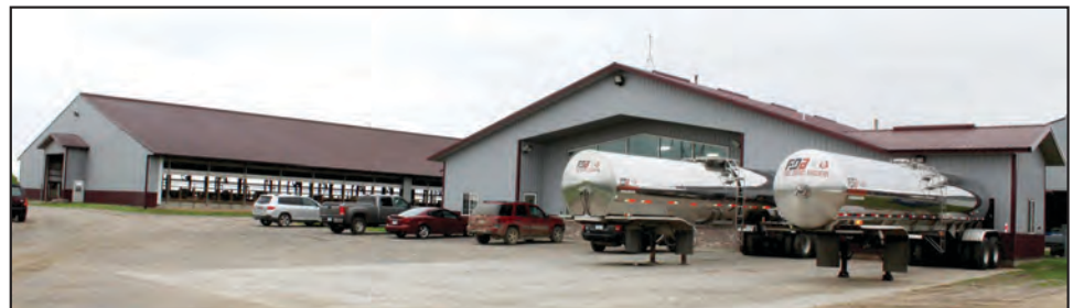
Landwehr Dairy is a family owned dairy farm near Watkins