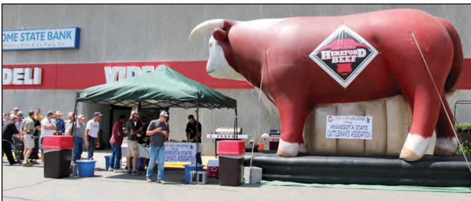
Tour attendees trying samples of Certified Hereford Beef at Cashwise Foods in Hutchinson