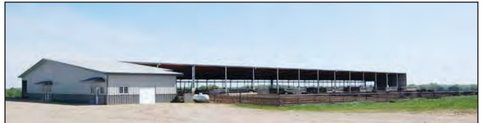
Schiefelbein Farms is a family owned Angus Cow/Calf Operation near Kimball.