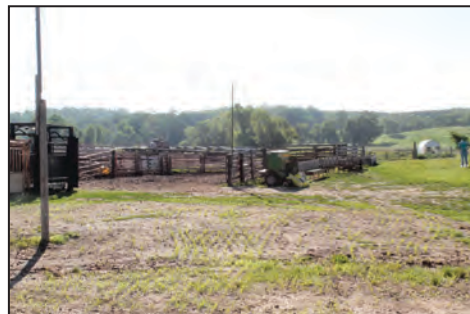
Schaefer Farms a family owned cattle feeding facility near Cokato.