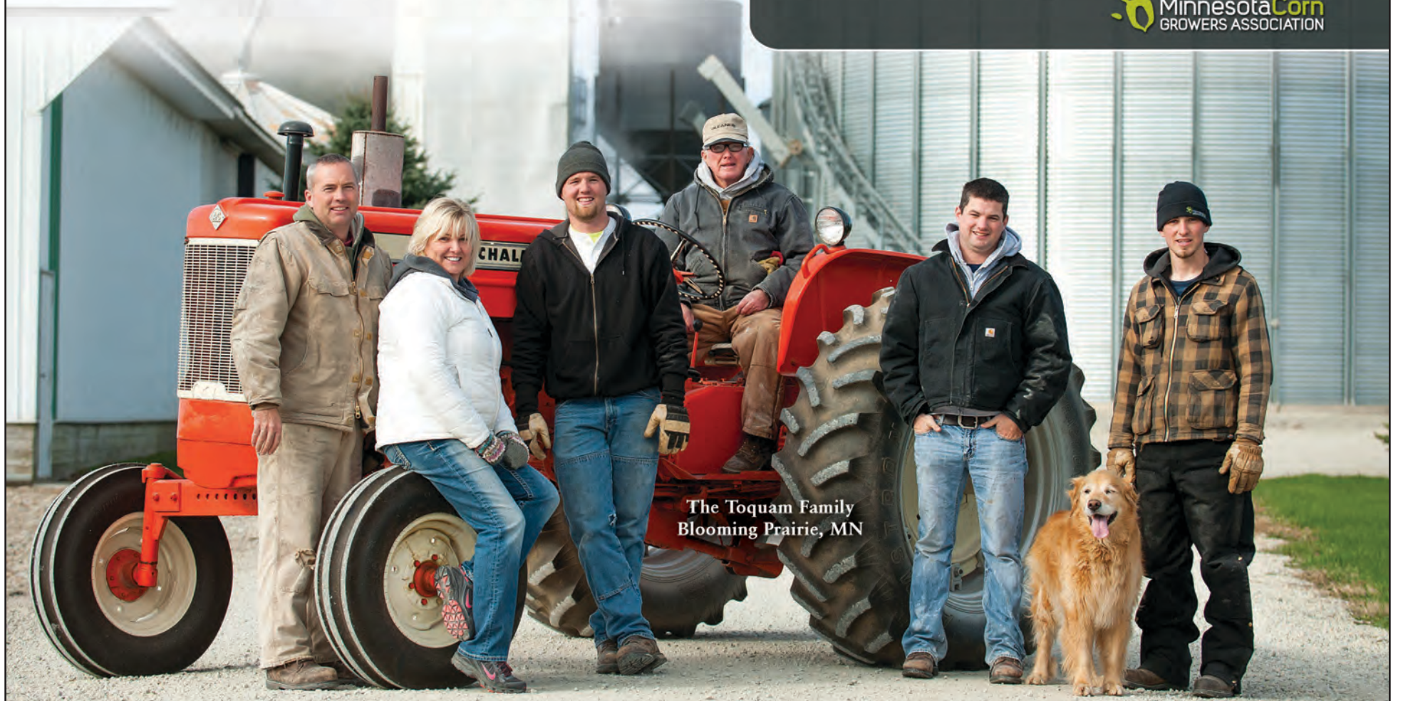
The Toquam Family Blooming Prairie, MN