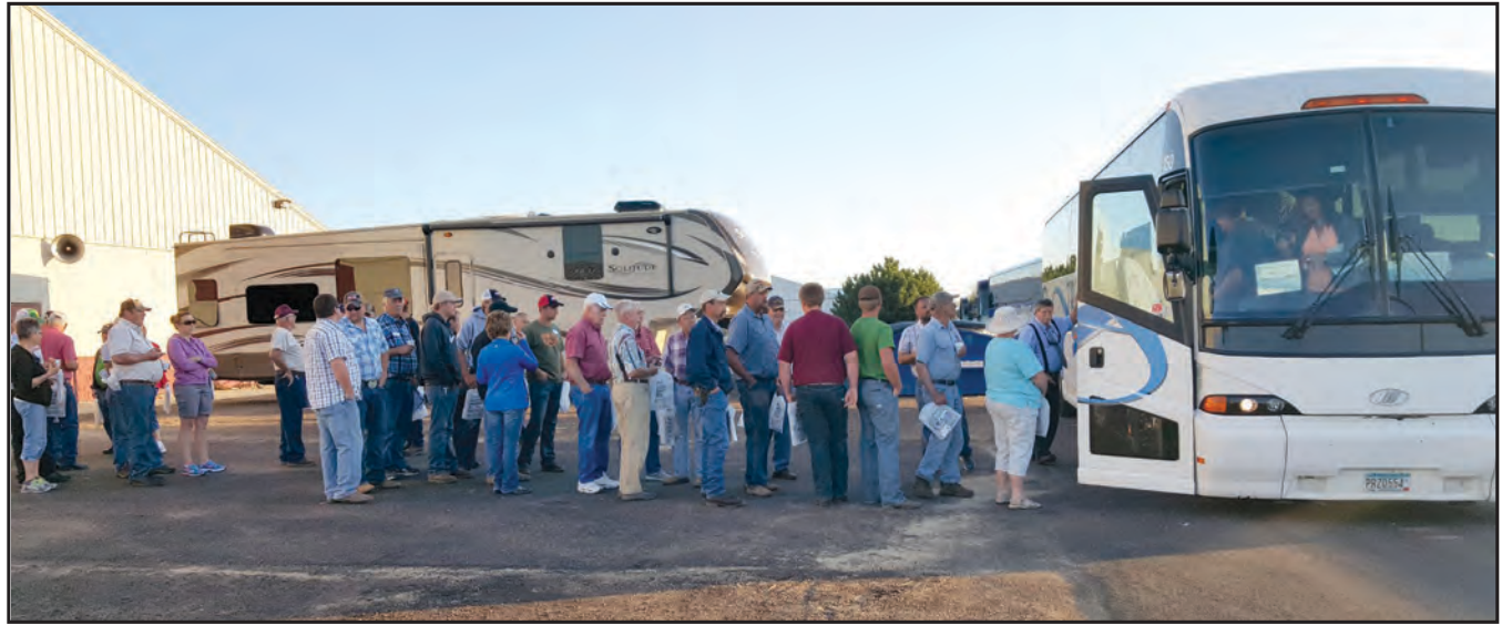
Tour attendees wait in line to load buses at the McLeod County Fair Grounds