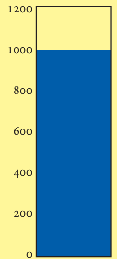
MSCA Membership Goal

Be sure to send in your membership renewal as soon as you can so we can continue having cattlemen working for cattlemen! (See membership form on back page)