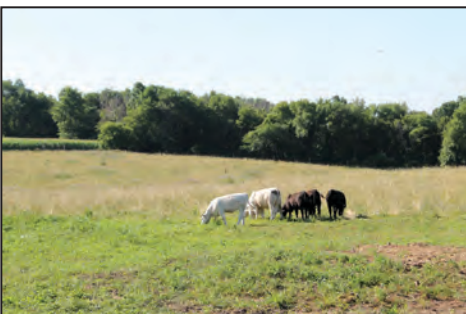
Polzin Embryo Center is a full service Bovine Embryo Transfer Facility near Darwin.